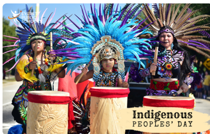
October 9 is Indigenous Peoples' Day