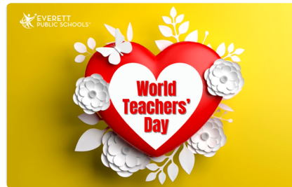
October 5 is World Teachers Day