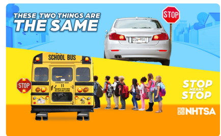
School Bus Safety Week is October 16-20