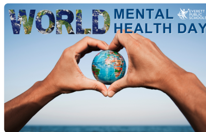
October 10 is World Mental Health Day