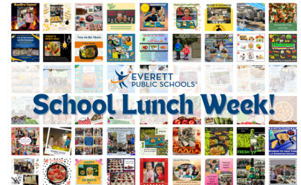
October 9-13 is School Lunch Week