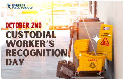
October 2 is Custodial Worker's Recognition Day